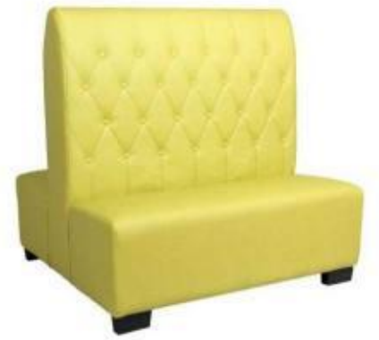
BD-17 1200*600*960mm 1200*1120*960mm