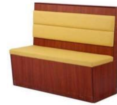
BD-32 1200*550*1050mm 1200*1000*1050mm