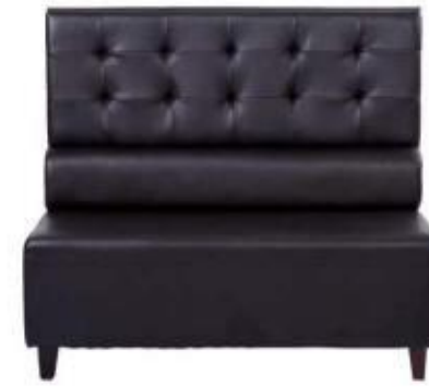
BD-15 1200*550*1050mm 1200*1000*1050mm