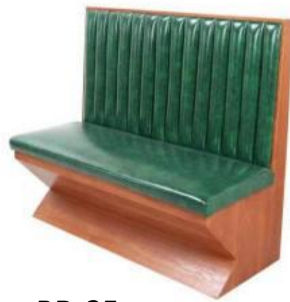
BD-35 1200*550*1050mm 1200*1000*1050mm