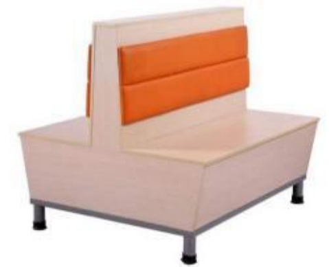
BD-38 1200*550*1050mm 1200*1000*1050mm