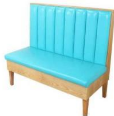
BD-40 1200*550*1050mm 1200*1000*1050mm