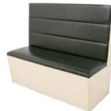
BD-43 1200*550*1050mm 1200*1000*1050mm