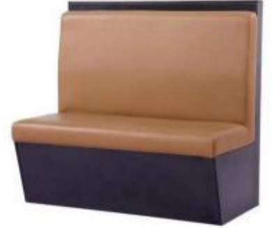
BD-33 1200*550*1050mm 1200*1000*1050mm