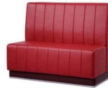
BD-16 1200*500*1050mm 1200*1000*1050mm