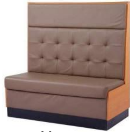
BD-30 1200*550*1050mm 1200*1000*1050mm