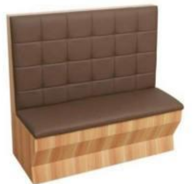
BD-44 1200*550*1050mm 1200*1000*1050mm