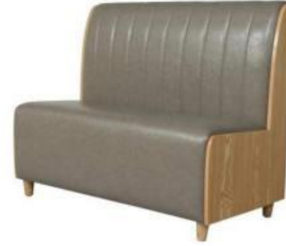
BD-31 1200*550*1050mm 1200*1000*1050mm