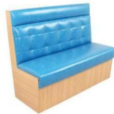
BD-42 1200*550*1050mm 1200*1000*1050mm