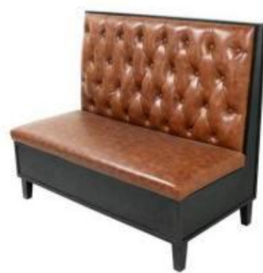
BD-41 1200*550*1050mm 1200*1000*1050mm