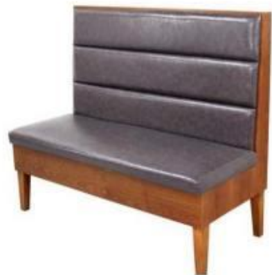
BD-39 1200*550*1050mm 1200*1000*1050mm